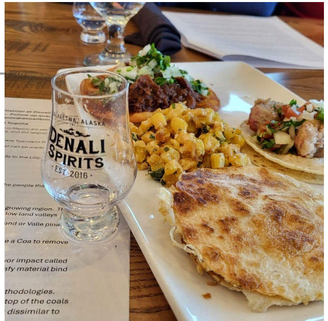
Food and an empty glass at the Denali Spirits tequila tasting