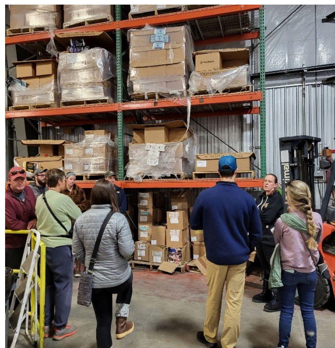
Beer Trippin' attendees on a tour of Denali Brewing